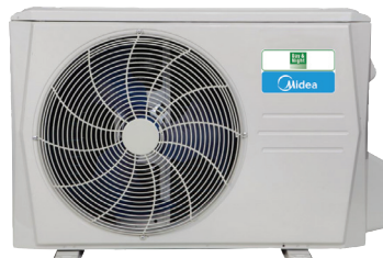
IDLCSRBH SINGLE ZONE OUTDOOR UNIT