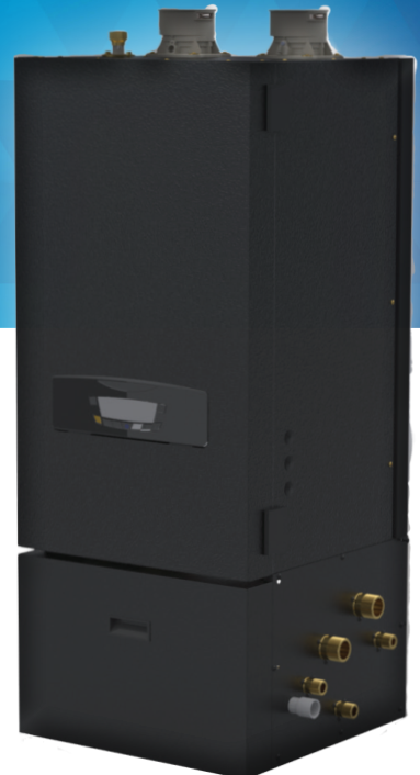
ELU-150 - 199 Boiler and 199 Combi Floor Mount ("FLKT") Model Shown