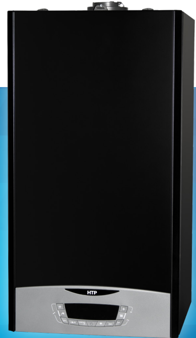
ELU-85 - 120 Boiler and 120 - 150 Combi Model Shown